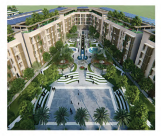
Ideally located Designer Offices

The Boulevard by Greens Enclave The High-end shopping hub of Gujrat